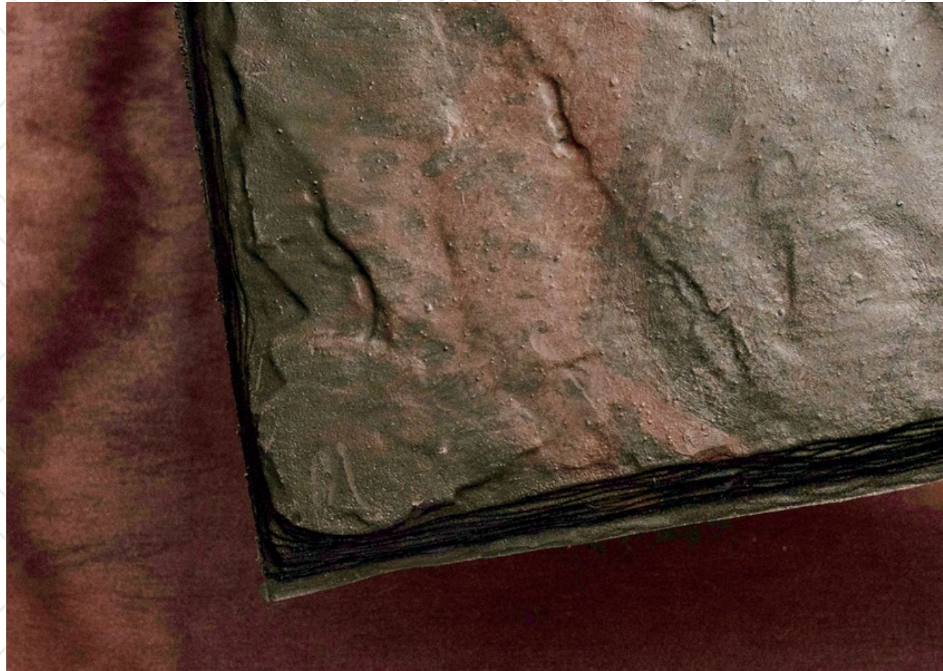
Brava Old World Slate Atlantic

Brava uses state-of-the-art compression molding technology. It's this precision of manufacturing that gives Brava Old World Slate its unparalleled strength.