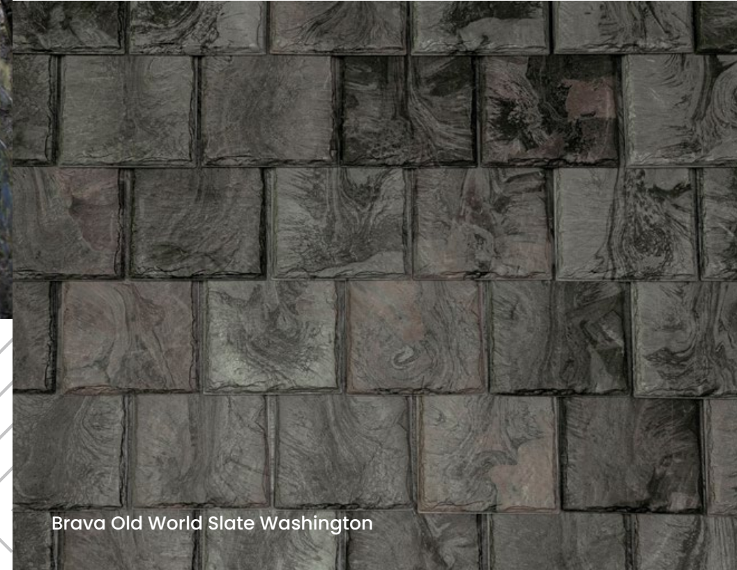
Brava Old World Slate Washington

Brava Old World Slate is the only synthetic slate with subtle authentic nuances of color variation found in Mother Nature.