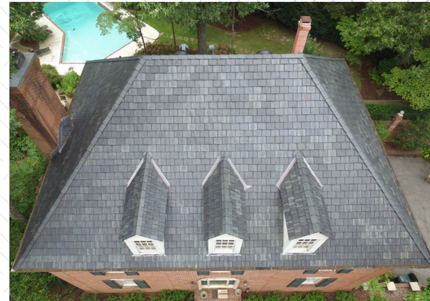
Brava Old World Slate Victorian

Brava uses the most advanced UV protection to guarantee superior long-lasting color.