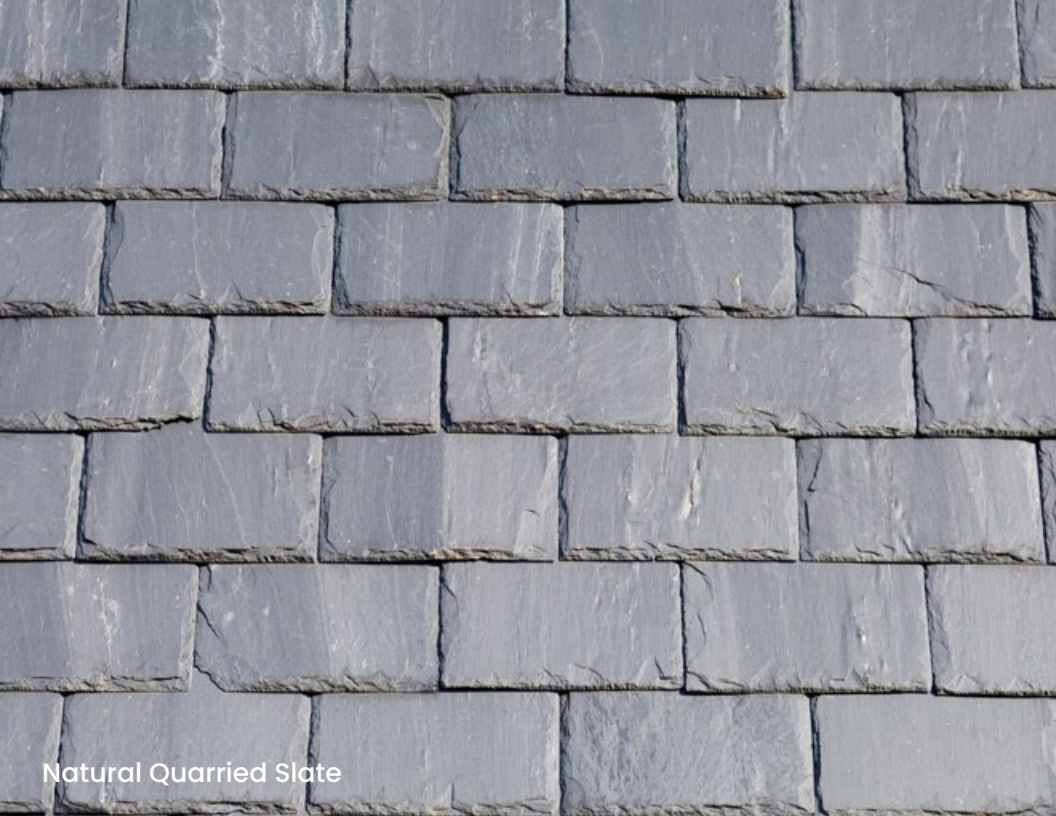
Natural Quarried Slate

Quarried slate has unique textures and hues.