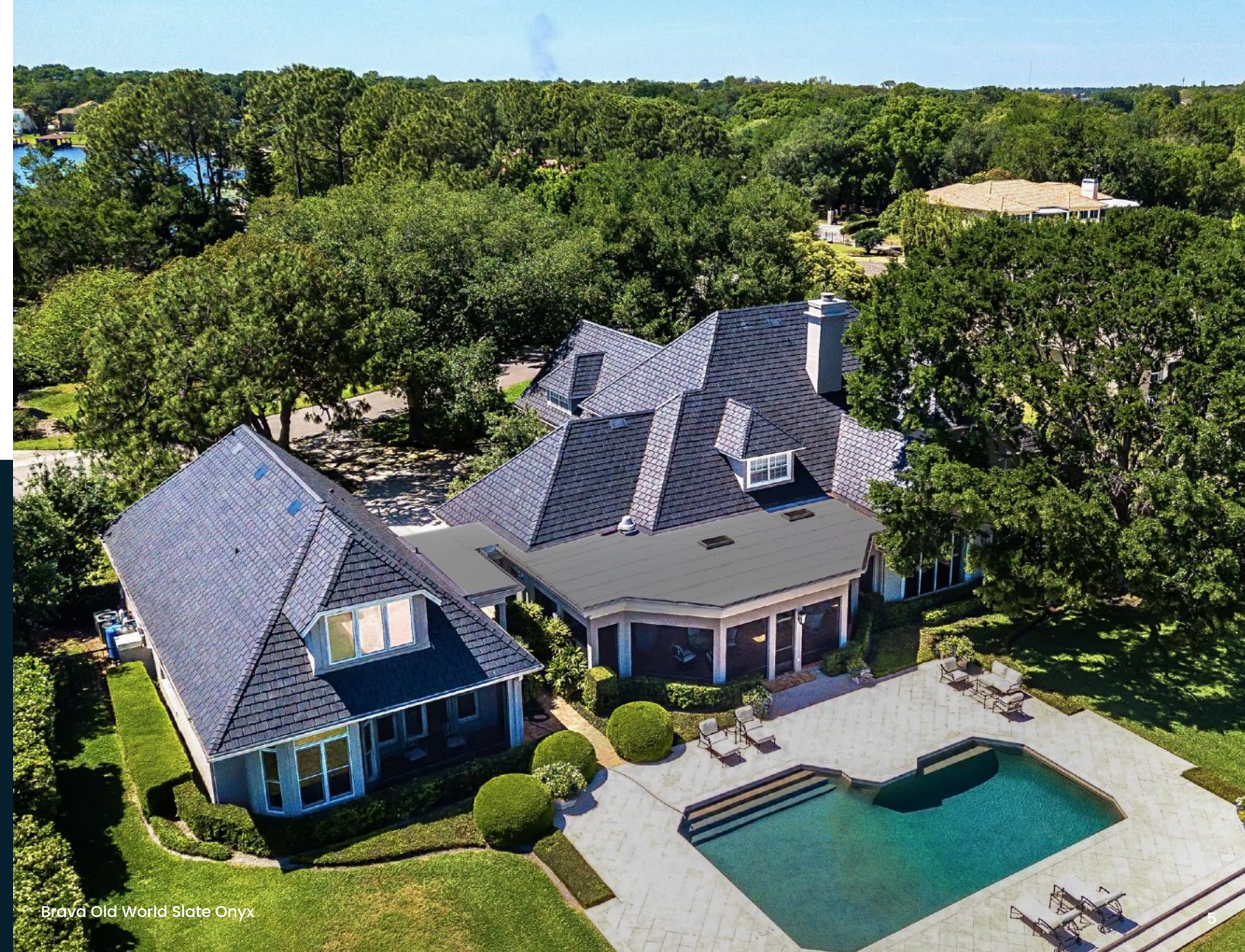
Brava Old World Slate Onyx