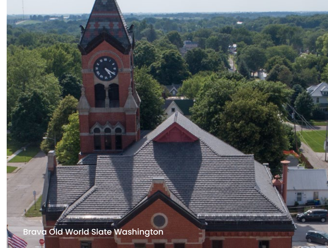
Brava Old World Slate Washington