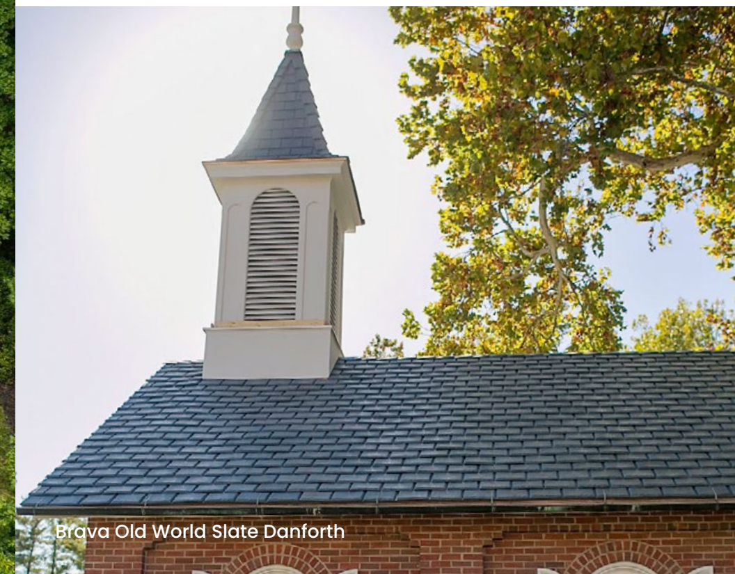
Brava Old World Slate Danforth

"We get a lot of mold in South Florida. We will never have that issue with Brava. It is close celled. It doesn't consume the water and collect mold."